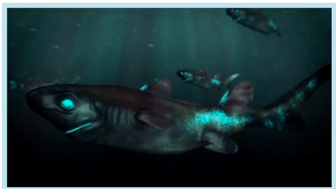
The Blobfish (left) and the Ninja Lanternshark (right) both live in the deep ocean.